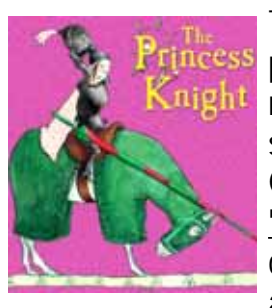
Tired of all the princesses in the media who wait to be saved by Prince Charming? The "Princess Knight" defies stereotypes and rescues herself.

When so many gifts marketed to girls are highly gendered, promoting stereotyped and objectified images of girls, holiday shopping can be a frustrating experience. Last year, AAUW created a list of gifts that defy stereotypes, encouraging girls to explore the whole range of hobbies and careers including sports, science, & engineering. Visit <u>AAUW.org/Issues/Community</u> for great gift ideas for all ages.