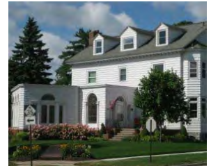
Randall / McLeod-Keller